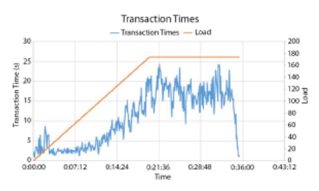
After Suggested Fix - Transaction Time Graph and load

To overcome issues with features not being delivered on time, environments being unstable and limit delays and disruptions in testing, we followed an agile approach by adjusting load tests to the existing stable functionality. This allowed the early provision of feedback to the development team, the quick discovery and efficient diagnosis of performance issues, and the prompt resolution of bugs.